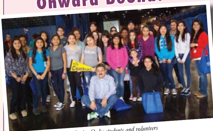
CIS Spring Oaks students and volunteers